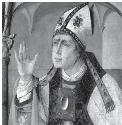
Detail from a painting of St. Augustine by Joos Van Wassenhove (c. 1410 – c. 1480).