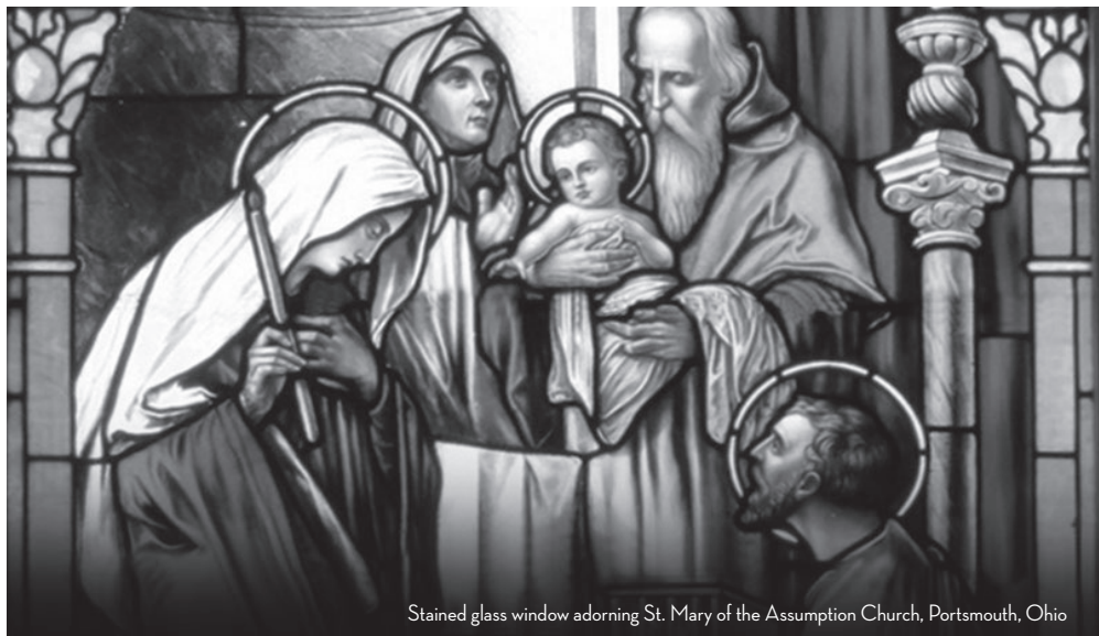
Stained glass window adorning St. Mary of the Assumption Church, Portsmouth, Ohio

"Keep St. Gabriel Radio in your prayers. Be extravagant in this generosity!"